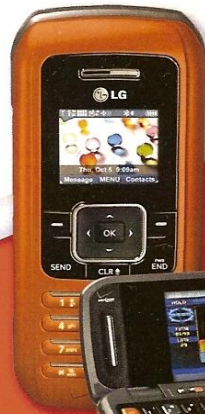
enV LG VX9900